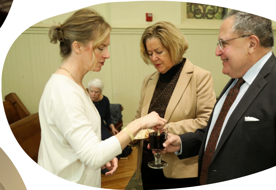
Right: Members share the Lord's Supper.