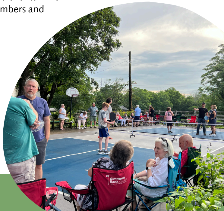
Right: This year's picnic included pickleball.

Events like Last Wednesday Fellowship dinners, First Sunday Fellowship after church, and our monthly lunch outings fostered deep relationships within our congregation. Our spring progressive dinner, summer picnic, and beloved Christmas events continued to be ways that God works in us and through us that are both spiritual and practical.