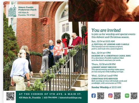
Above: HFPC's Christmas mailer went to 5,000 local homes.