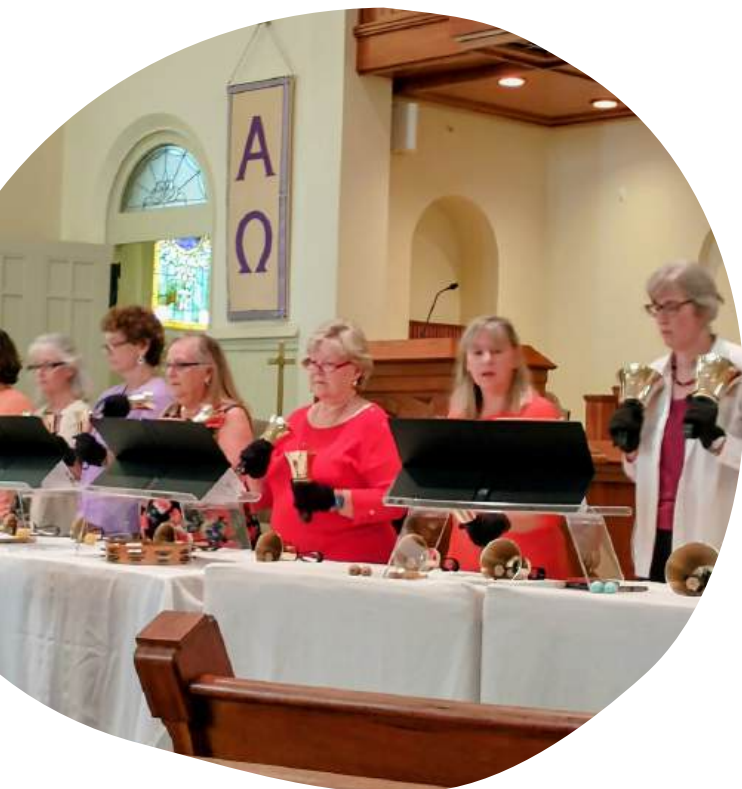
Above: The Bell Choir leads during worship.